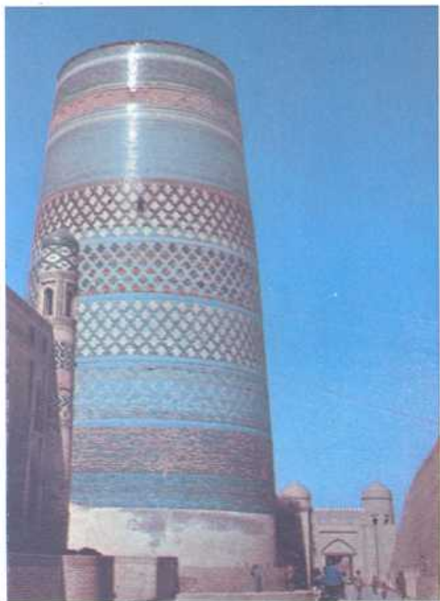
Khiva . Kalta Minaret . 19 th c.